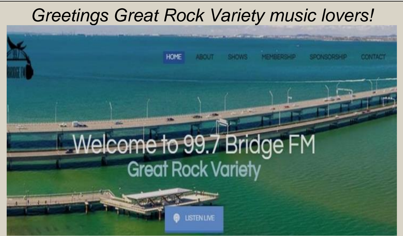
"October, and kingdoms rise, and kingdoms fall, but 99.7 goes on and on" (Adapted from U2's October)