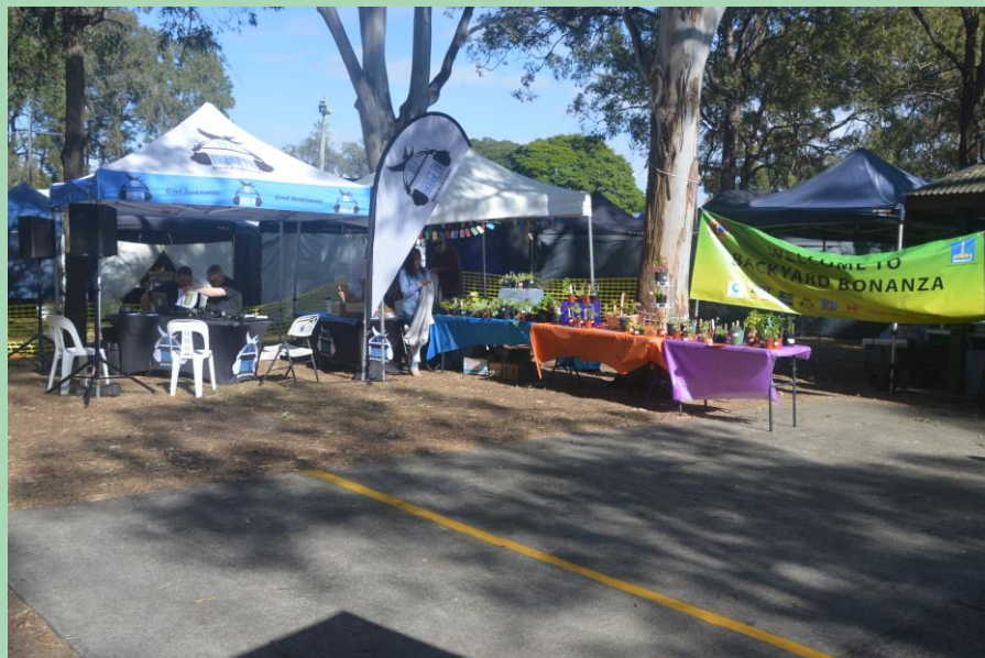
Getting ready for a huge, fun day!