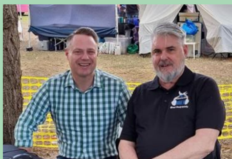
Lordy, Lordy, Bownie!!