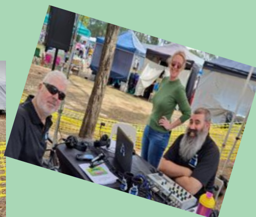
Anyone here from Wednesday Breakfast show (Hint: maybe all!!)