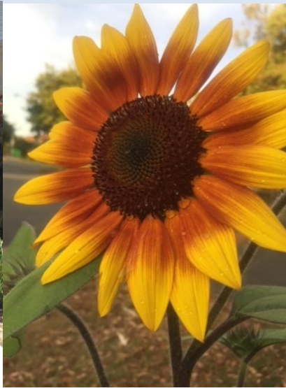
'Stuck in the middle with you'