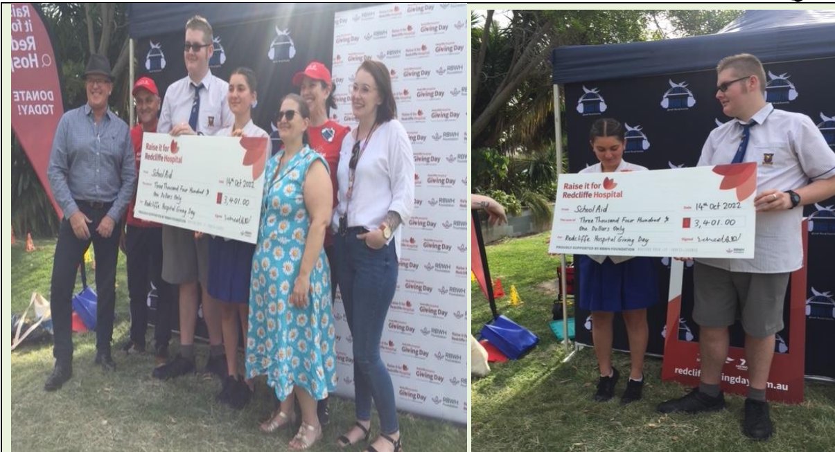
Another generous donation from the local community – School Aid

Special Thank You to the following for supporting 99.7fm and Raise it for Redcliffe Hospital Giving Day